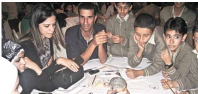
The national representative

Every school can become an ES by applying to the ESP through the national representatives, The Royal Marine Conservation Society of Jordan.